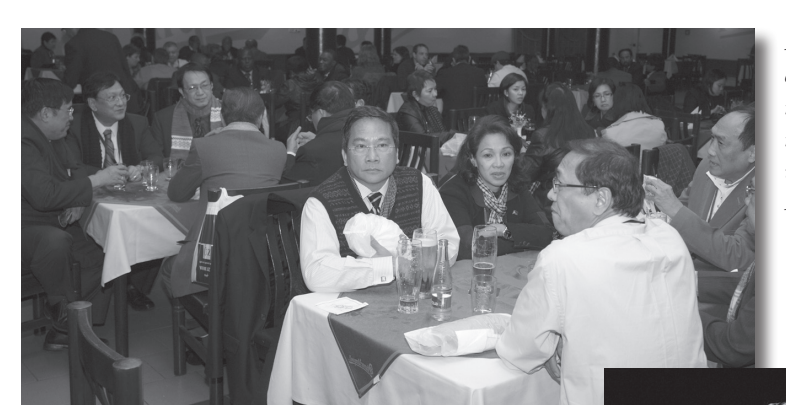
Left: Delegates enjoyed a relaxing dinner reception at the world famous Pilsner Brewery.