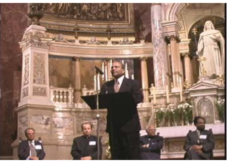
"Today, after our sight-seeing tour, it would perhaps be appropriate to compare our wide and variegated way of analysis, inherent in the structure of our discussions

"In doing all this, we are breaking the language barrier and transforming local and national problems into topics developed for solutions by multi-national forums. Such comparative effort is usually of stronger effect and more convincing in weight and persuasive power than decisions developed only within the framework of municipal law, without a priori comparative consideration and evaluation of alternative solutions created elsewhere.