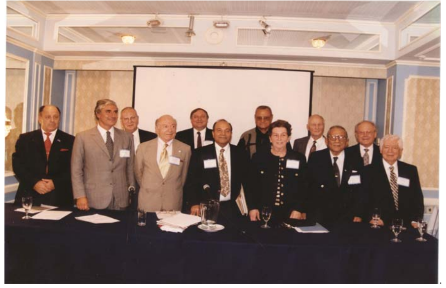
Members of the Board of Governors Present at the Closing Ceremony.